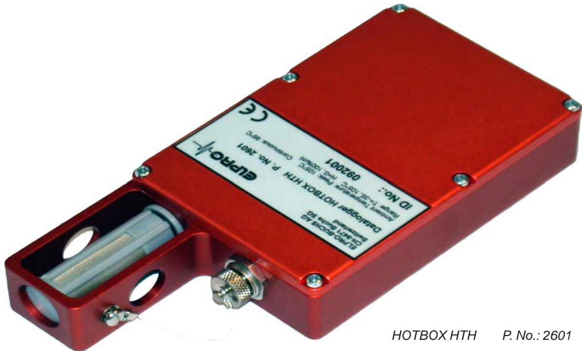
HOTBOX HTH P. No.: 2601

Ranges: 0%..100%rH, -35°C..+105°C (105°C up to 1 hour, continuous 95°C)