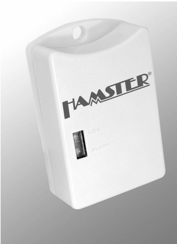
Datalogger Hamster ET1