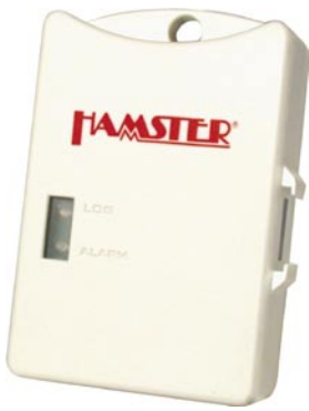
Hamster ET1 Hamster ET1-D

Art.Nr. 4901 Art.Nr. 4904 (with display)