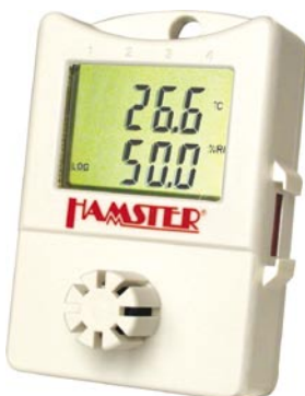
Hamster EHT1 Art.Nr. 4903